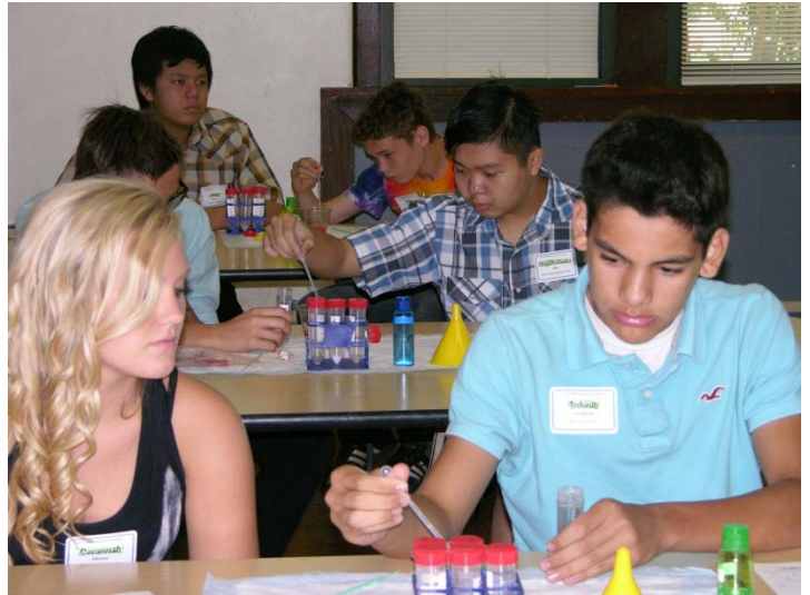
Middle school students from around the state engage and explore their science and math interests at one-day OSSM workshops sponsored by Williams Companies